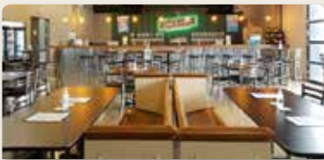
Business Spotlight (p5)