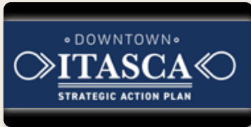
Downtown Plan (p4)