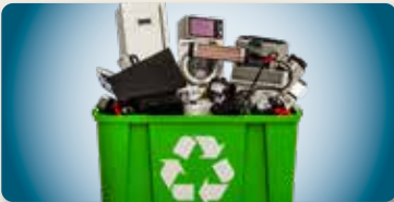
Green Day Recycling Event (p7)