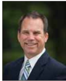
Mayor Jeff Pruyne

July 21 started just like any other warm summer Friday. What we did not know when we woke up that morning was Itasca would be a different place when we returned to our homes from work later that day. At approximately 5 pm Itasca was hit with a microburst that destroyed thousands of trees, damaged homes and garages, caused widespread power outages, and left a path of destruction throughout much of the Village. I never imagined a storm that lasted minutes could produce so much damage. Amazingly no one was injured from the storm.